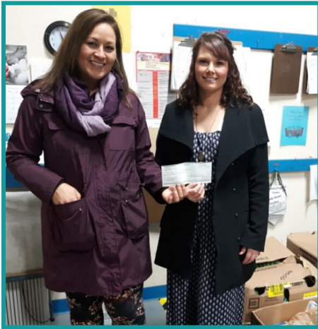
Greenleaf Living Center

Church Community Services was blessed with many donations of food and financial support from area businesses and churches the past few months. We are so grateful to all our donors who help us help our neighbors in need. Here are just a few!