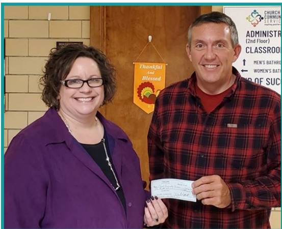
Elkhart IMRG Chapter 1986