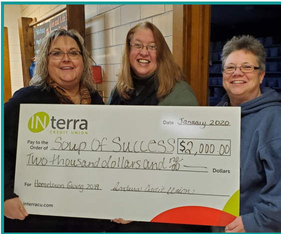
Interra Credit Union