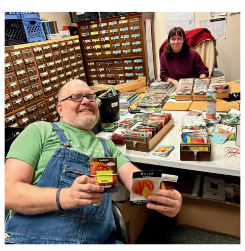
Grateful for our volunteers' help and gardening knowledge during seed sorting and inventory