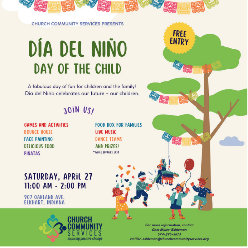
Bring the little ones and celebrate Día del Niño with us! Saturday, April 27 11am - 2pm 907 Oakland Ave Elkhart, IN