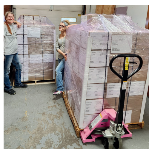
HomeGoods is now selling our soup mixes