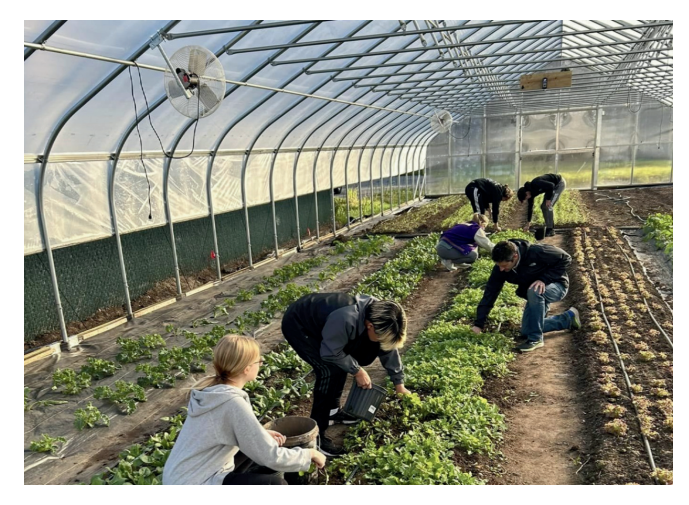
Elkhart Christian Academy helped us collect our first harvest from the new production greenhouse