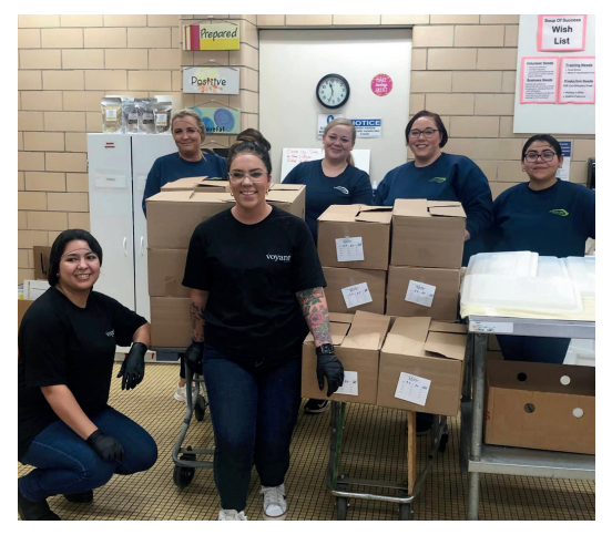
Especialized Staffing Solutions-Elkhart, Bimbo Bakery USA, and Voyant Beauty volunteered at Seed to Feed, the pantry, and Soup of Success