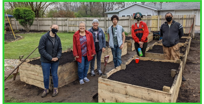
Spa Ministries Raised Beds

Seed to Feed has also grown to include the Teen Growers internship for youth in Elkhart County. Teen Growers is now offered three times during the year, spring, summer and fall, so that teens have the opportunity to learn and help their community during all three parts of the gardening season. Interns gain work experience as they tend our garden and greenhouse. They learn about nutrition and gardening and are encouraged to take home fresh home fresh food to their