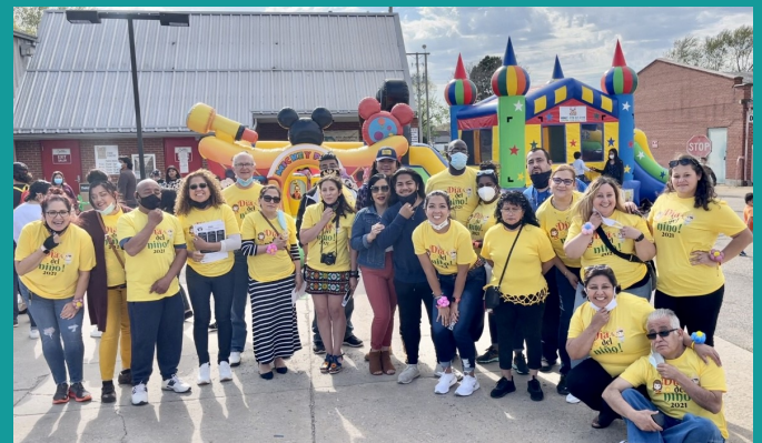
Thank you to our volunteers!