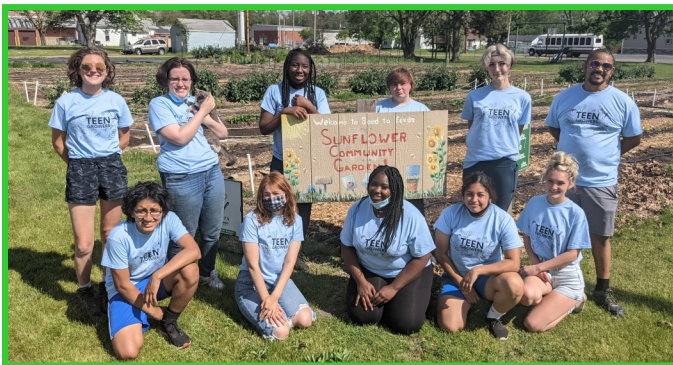
Spring 2021 Teen Growers Team

This spring Teen Growers learned how to build raised beds for gardening. In April they installed their first batch of raised beds at SPA Ministries where they will grow fresh produce for their residents.