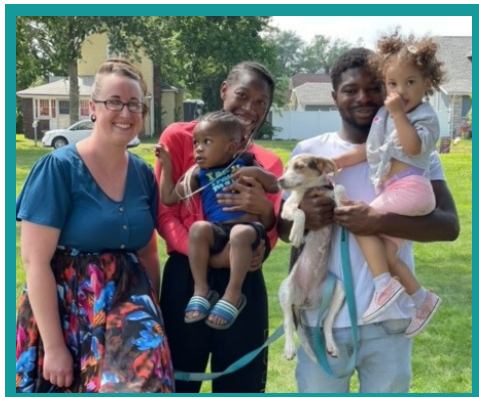
Neighbors who met at the block party.